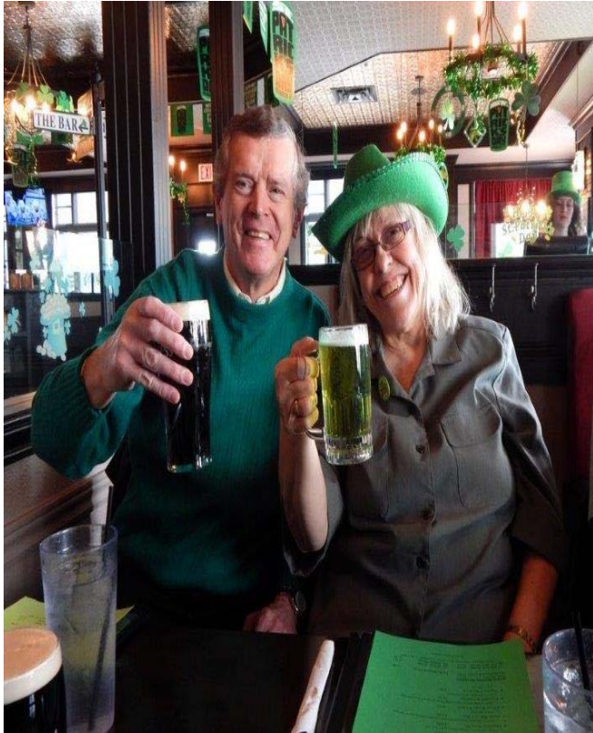
Green Beer and Guinness

On Tuesday March 17, we gathered for an 11:30 am lunch to celebrate St. Patrick's Day. Our meeting at the newly opened pub, Ye Olde Squire, on Upper James was a huge success. We had a large crowd, drank green beer and ate authentic Irish food. We even made Snap Magazine.