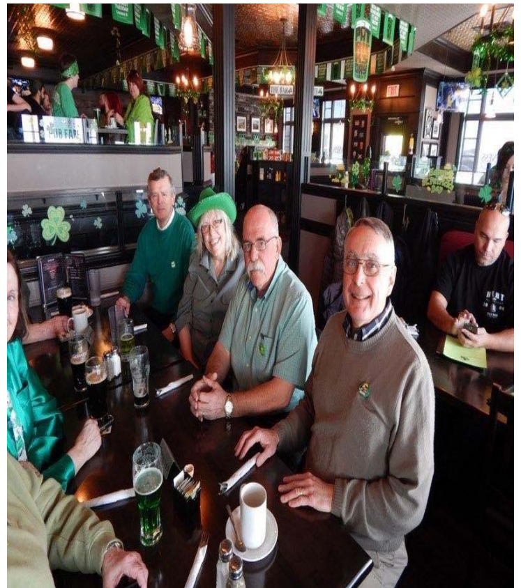
Green beer and Irish fun