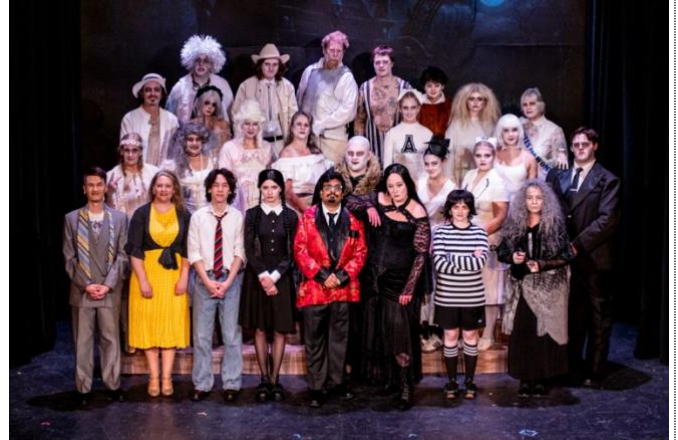
Addams Family Cast

Last year, fifteen chapter 13/16 members were entertained by "Man of La Mancha". This year, we moved from dreams of chivalry to screams and comedy. On Thursday, April 2, several Chapter 13/16 members attended OnStage Uxbridge's production of The Addams Family, the Musical . The characters of Morticia and Gomez Addams were captivating as they revealed the problems when family members keep secrets. The entire cast, ghoulish as many of them were, delighted the audience with great singing, choreography, acting and, of course, a live band. Yes - they were creepy, kooky, mysterious, spooky and altogether ooky!