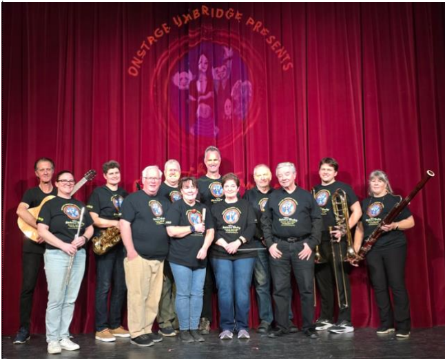
Addams Family Band