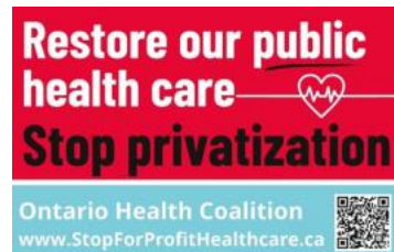
English lawn sign design

Chapter 13/16 has a few of the OHC's anti-privatization lawn signs available for members. If you would like one, contact us via our email at chapter13and16@gmail.com to let us know where you are located and we will arrange to deliver it to you.