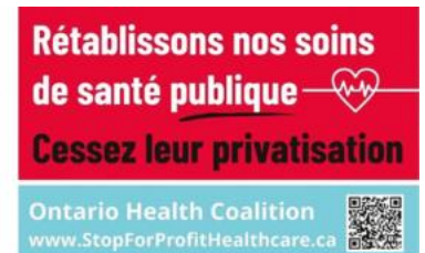
French lawn sign design