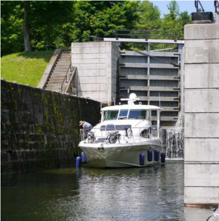
Locks At Jones Falls

Looking forward, chapter members and friends can help sustain the vitality of the group with feedback about what we should continue doing, what to do more – or less – often, what new things to try.