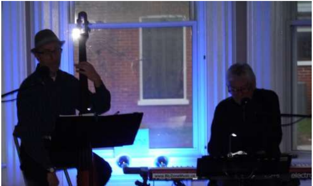
BluZone entertained in Dec 2015

Since John's 2008 report, there have been 93 meetings of Chapter 29 between Jan 2009 and October 2016. The seven Christmas gatherings have included two more theatrical productions by our own thespians and two sets of musical entertainment alternating with wine and cheese parties in the pattern established since 2004.