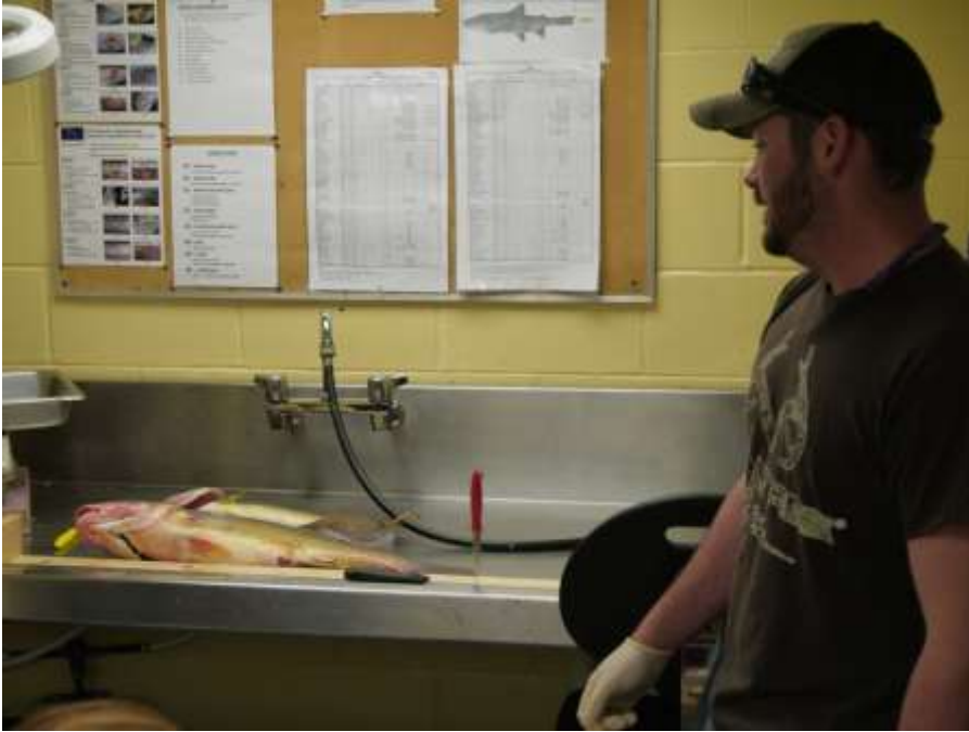
Glenora Fisheries Research