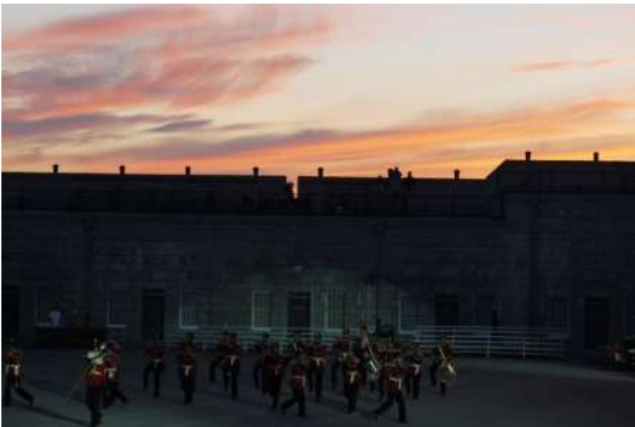
Fort Henry Sunset Ceremony