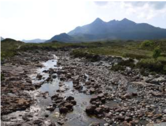
The Cuillins on Skye, the "Misty Isle